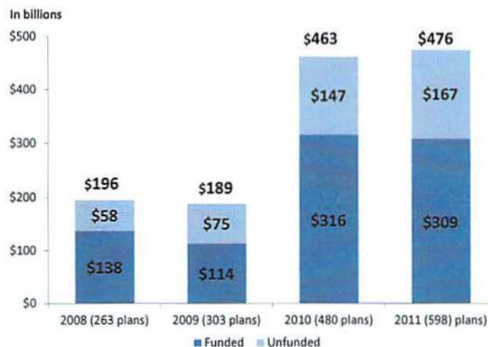
Exhibit 2 Aggregate Benefit Liabilities (Termination Basis) reported in 4010 Filings

ERISA Section 4010 requires that, for each plan included in a 4010 filing, “the amount of benefit liabilities ... determined using the assumptions used by the corporation in determining liabilities” is reported. Exhibit 2 shows the total amount reported (all plans combined) in each of the four post-PPA years. For this purpose, liabilities are measured on a termination basis (i.e., using assumptions provided in PBGC’s Section 4044 regulations) and therefore, this amount is commonly called “termination liability.”